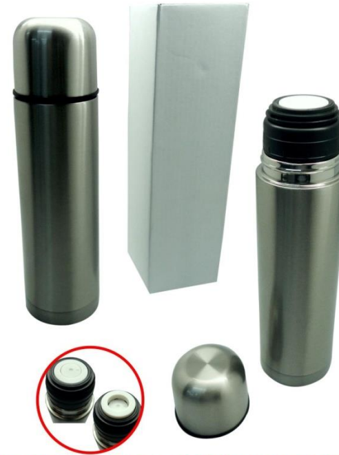
STAINLESS STEEL VACCUM FLASK