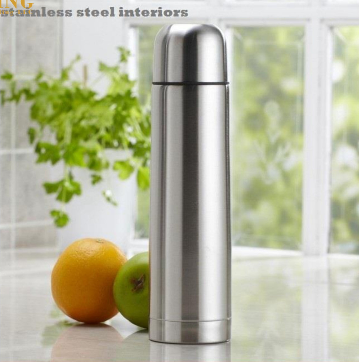
Double wall vaccum flask